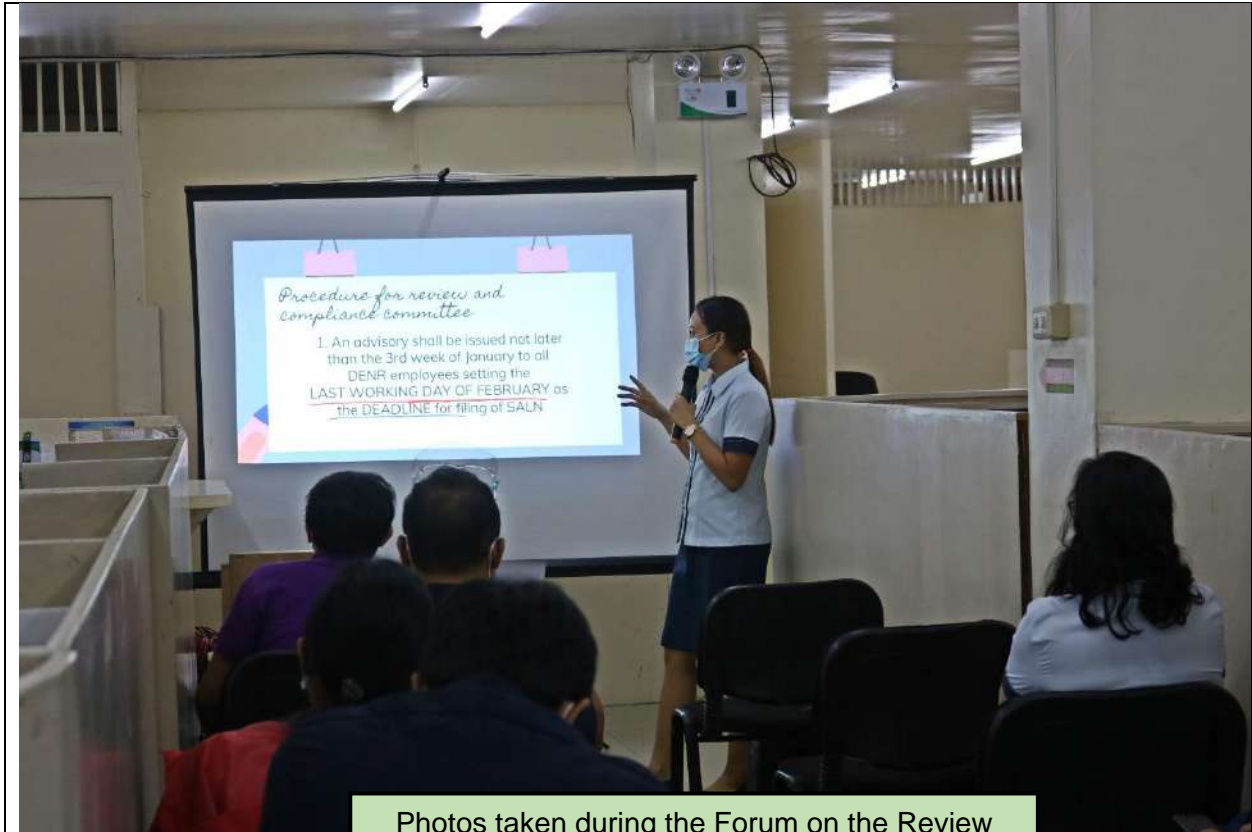
Photos taken during the Forum on the Review and Compliance Procedure on the Filing of Statements of Assets, Liabilities and Net Worth